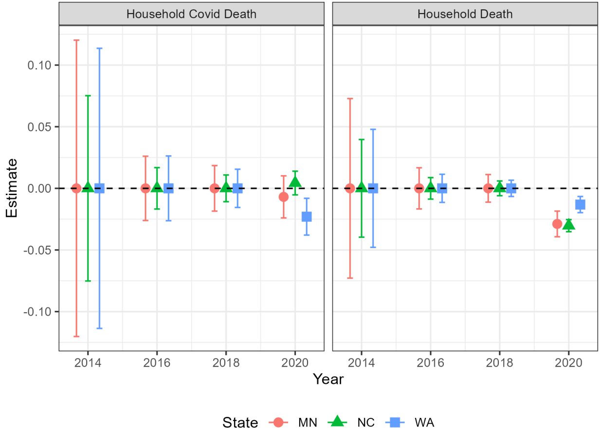
Figure A2: Turnout by Household Death Status